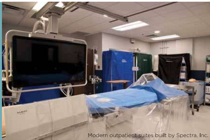
Modern outpatient suites built by Spectra, Inc.

from reimbursement changes, and increased value, if one is considering opening their own ambulatory care facility, it may make sense to forge a new path and open an AOH (ASC-OBL-Hybrid). After all, flexibility is a great strategic asset. V